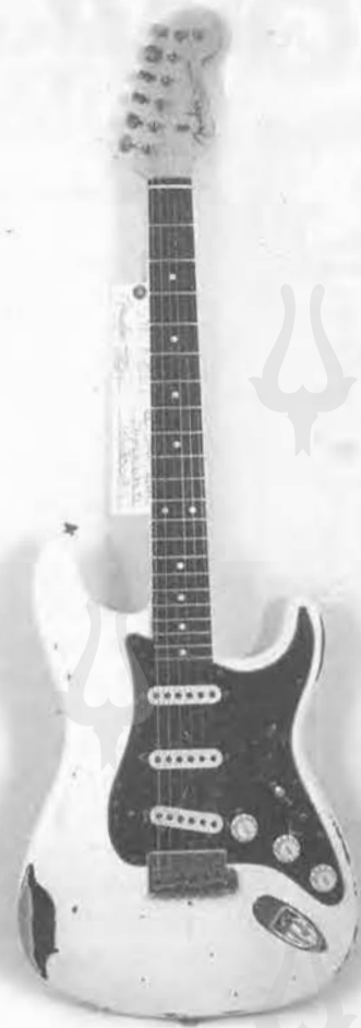
Fender Custom Shop '60 Strat Heavy Relic, Olympic White over sunburst