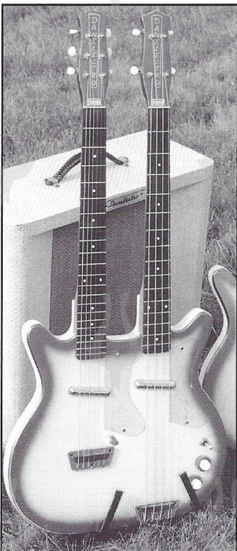
Danelectro Doubleneck 6/4