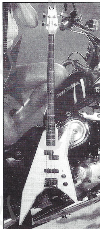
1985 Dean Mach V