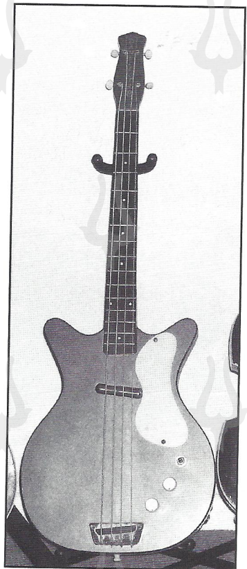
1960 Danelectro 3412