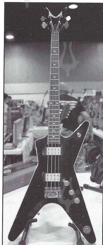
1981 Dean ML