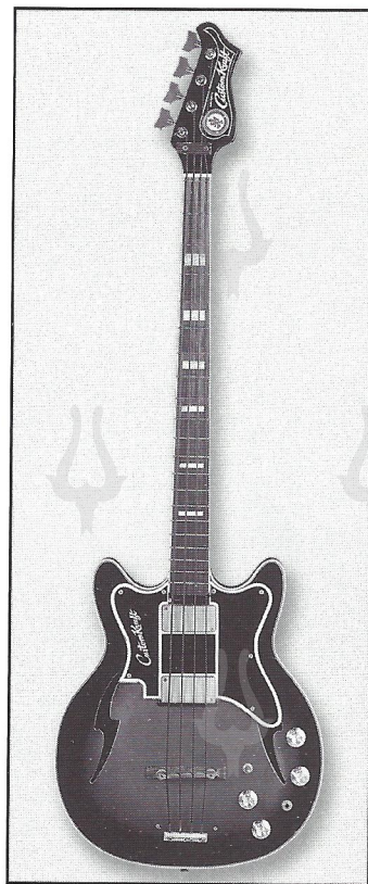
1968 Custom Kraft Bone Buzzer