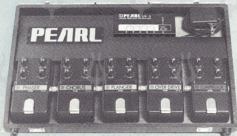
Pearl Spice Rack.

The new Cort Arrow guitar features a slim, mahogany, fully adjustable neck with a rosewood fingerboard, nickel silver frets and Gotch die cast machine heads on the