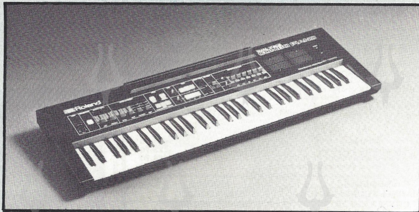
Roland Combo Piano.