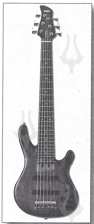
TRB 6