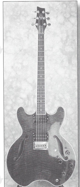
Daion Semi-Hollowbody