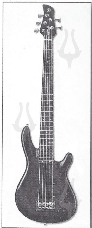
TRB 5 P